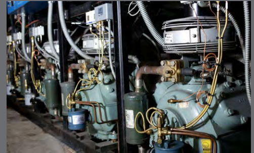
The RRRink’s two parallel compressor racks