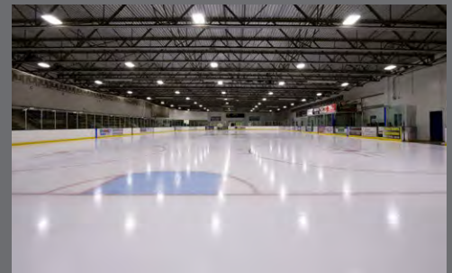
Ice at The RRRink now freezes faster

“The switch to R-448A calmed down the compressor cycling and was really impressive.”